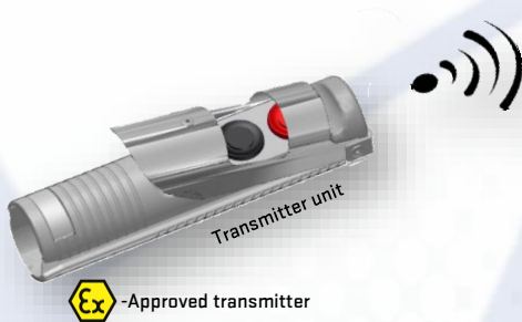
DE212 XLR system diagram (Not to scale)

Easy installation. Installation guidelines for Mobile control unit and central unit are included.